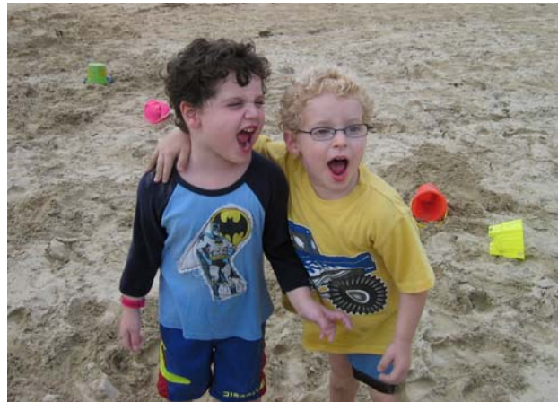
Our "Pure Boys" in Bo Bo Brooklyn